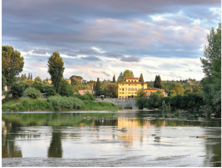
Villa la Massa with the River Arno in front

Surrounded by rolling hills and vineyards the Castel Monastero in Chianti offers an authentic Tuscan experience in the elegant surroundings of a converted monastery. Now a hotel with 74 rooms and suites the hotel has not lost its sense of tranquillity or rustic charm. With a wide range of spa facilities and also cookery courses and wine tasting the hotel truly appeals to those looking for a traditional Tuscan experience.