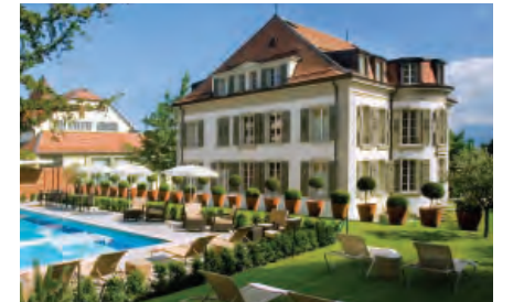
Hotel Angleterre et Residence, Lausanne