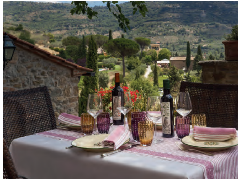
Il Falconiere, near Cortona

Collect your hire car and drive out of Florence through the Chianti countryside to Castel Monastero near Castelnuovo Berardenga. The drive is about 55 miles and takes around an hour and a half. Spend two nights at Castel Monastero enjoying the surroundings of vineyards, gently rolling hills and the turrets of Siena in the distance.