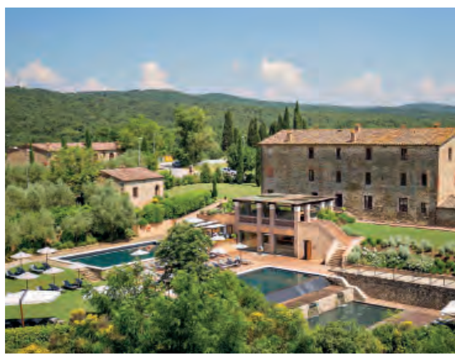
Castel Monastero, Chianti

Travelling to by train to Tuscany is an attractive option with a number of different routes from the UK to Florence and back. The most direct train route involves an overnight sleeper from Paris to Milan, allowing the entire journey to be made with just two changes. However, a popular alternative for your rail holiday is to take in the beautiful scenery along the way and use daytime trains. One route in particular takes in the Gotthard Pass after a night in Zurich and another goes via the Simplon Pass, after an overnight stay in Lausanne on Lake Geneva. Once in Italy, you start acclimatising to Tuscany by staying in the regional capital, Florence. Then, in order to explore the region in depth, you collect a hire-car. Driving distances are always manageable; allowing you to explore the beauty of Tuscany's rolling hills, villages and vineyards at a suitable leisurely pace, with two stops in Tuscany, one in the southern Chianti region and the second further south near the ancient Etruscan town of Cortona. Finally, you return to the Florence area for one night nearby so that you are within easy reach of Florence for the train to Milan, and then the sleeper service to Paris.