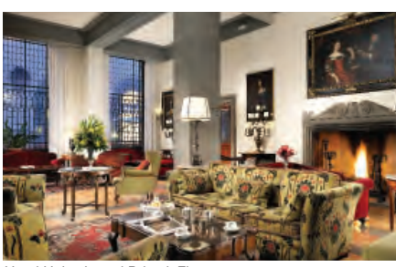
Hotel Helvetia and Bristol, Florence